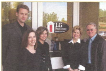
LG Real Estate Team