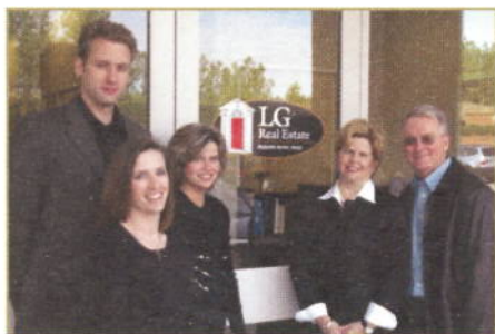
LG Real Estate Team

* See our Market Update for more details on today's market.